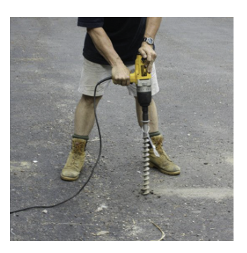
Pre drill pilot hole with impact wrench (this determines holding power). Earth Anchor can then be installed.