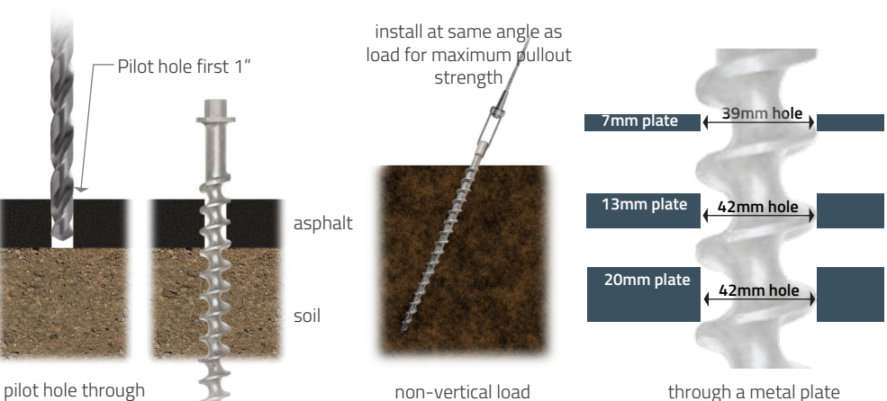
non-vertical load through a metal plate