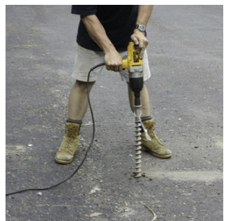
Pre drill pilot hole with impact wrench (this determines holding power). Earth Anchor can then be installed.