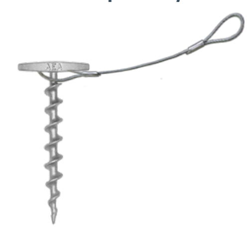
10" Tie-off cable