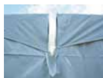
Gutter to join two marquees