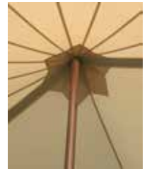
Alloy centre and side poles coated in 'Timbertec' to give a realistic timber finish