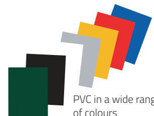
PVC in a wide range of colours